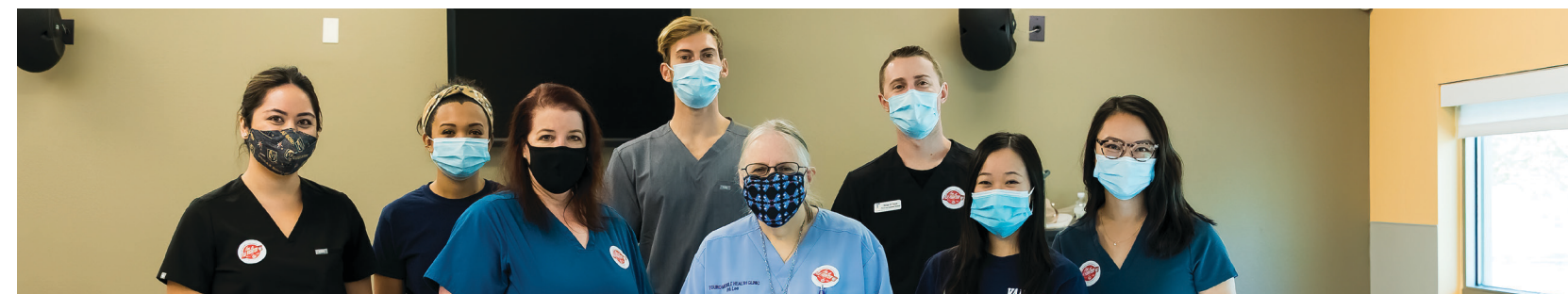
Touro's PA students and faculty provided flu shots at different locations across the Las Vegas Valley.