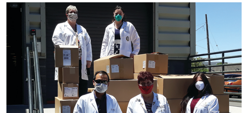
Students and faculty helped create 20,000 COVID-19 test kits for the Southern Nevada Health District. This is one way our research labs can make an immediate impact while we continue to research diseases and help save lives.