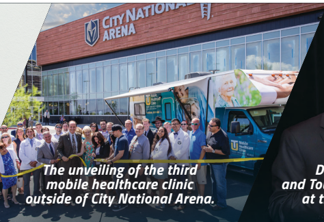
The unveiling of the third mobile healthcare clinic outside of City National Arena.